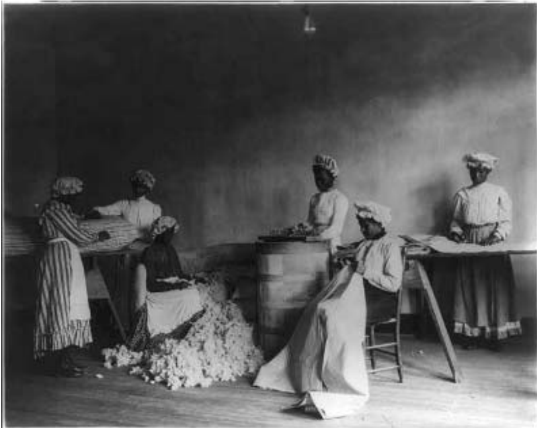
African American students in mattress-making class