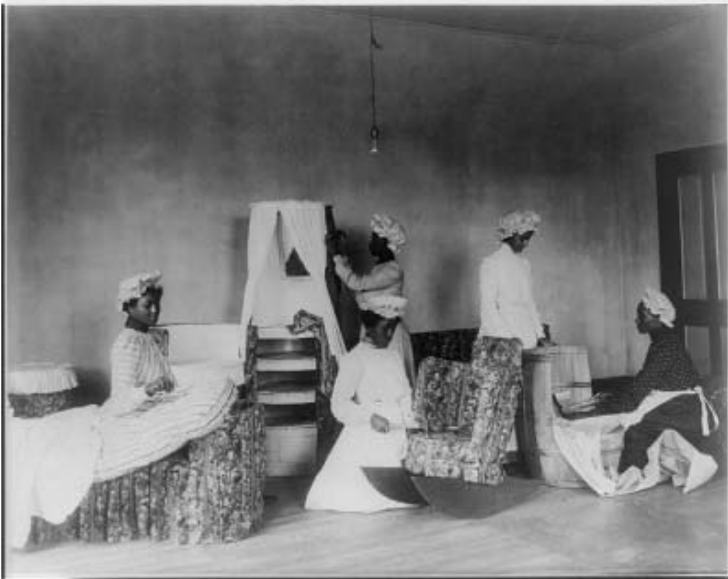
Students making and upholstering barrel furniture