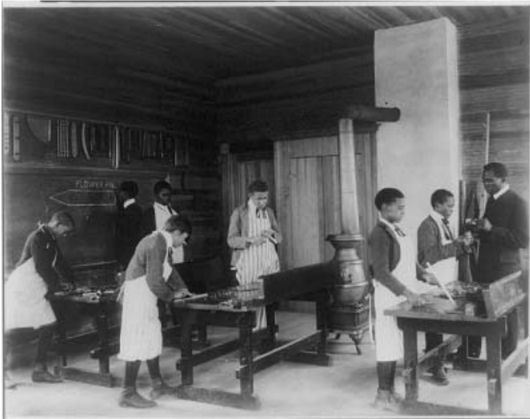
Students in workshop