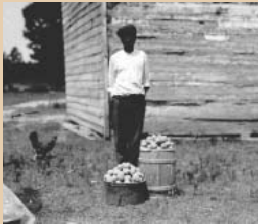
African American children in Home Makers Clubs displaying produce from their vegetable gardens. Virginia, 1911-1915