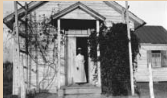
"Colored" School that had been repaired and whitewashed by the students. Virginia, 1911

Among other things, he told about the "Clean-up Day" that the Negroes of Virginia had last April, when 100,000 Negroes were influenced to observe the day. I am especially pleased to know of the hearty response and sympathetic co-operation that were shown by the white people, and by the white papers in reporting this state-wide "Clean-up Day." I was particularly pleased to note the editorials in the Times-Dispatch and other leading white papers of the state, commending the effort and calling upon the white citizens to use their influence with the colored people in their employ to get them to observe the day. I was equally gratified to observe the great interest that the colored people themselves manifested and the large amount of work they did in cleaning up Virginia.