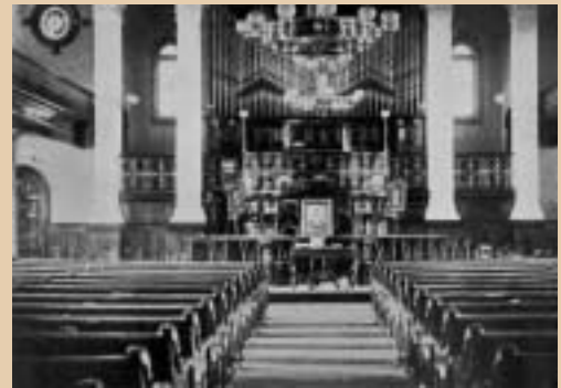
First Baptist Church