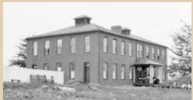
"Colored" school with addition costing $10,000, with an "assembly room, ventilating systems, water, electric lights, shower and baths." Virginia, 1911