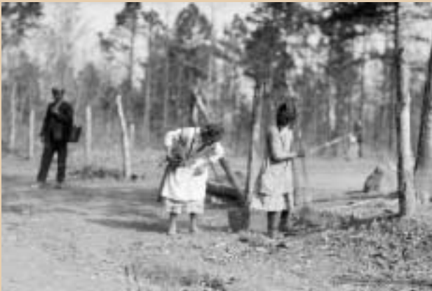
Children's club cleaning grounds. Virginia, 1913

The Bible tells us that cleanliness is next to godliness. When the colored people in a great state like Virginia all get together and co-operate for a general housecleaning — whitewashing their houses, fences, and outbuildings, cleaning out their wells and springs, and seeing that their schoolhouses and homes are properly ventilated — this people is making progress, not only along health lines, but also along educational and religious lines. Through the Organization Society the Negroes of Virginia are contributing, not only towards their own improvement, but also towards the improvement of the state as a whole.