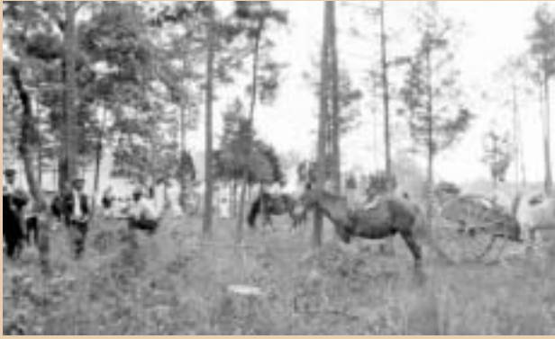
Cemetery cleaning. Virginia, 1912