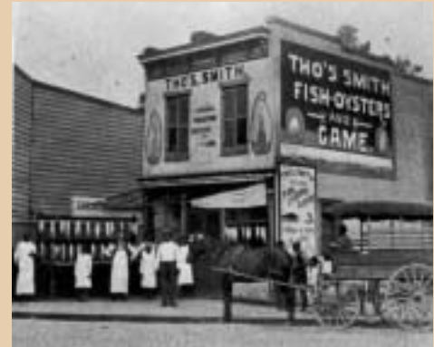
Retail and Wholesale Grocery