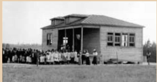
New two-room "colored" school with broad windows for adequate ventilation, and members of the governor's visiting party. Virginia, 1914