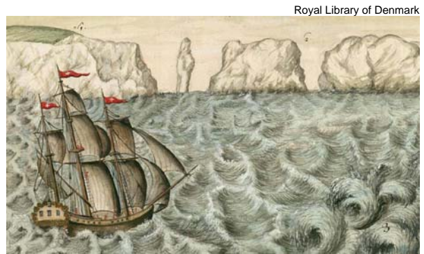
von Reck, refugees' ship in the English Channel 1

Jan. 28. An Alarm of Fire caused a great Consternation in the whole Ship, but no ill Accident ensued. For my part, I think that GOD designed by this Alarm to call us to Repentance and to put us in mind of the Uncertainty of this Life, and the Eternity of the next. . . .