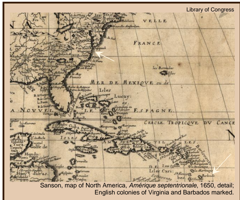
Sanson, map of North America, Amérique septentrionale , 1650, detail; English colonies of Virginia and Barbados marked.

Amongst many other weighty Reasons, why Virginia has not all this while made any progression into staple Commodities, this is the chief. That our Governors by reason of the corruption of those times they lived in, laid the Foundation of our wealth and industry on the vices of men; for about the time of our first seating of the Country, did this vicious habit of taking Tobacco possess the English Nation, and from them has diffused itself into most parts of the World; this I say being brought to us from Spain at great prices, made our Governor suppose great wealth might be raised to particulars by this universal vice, and indeed for many years they were not deceived,