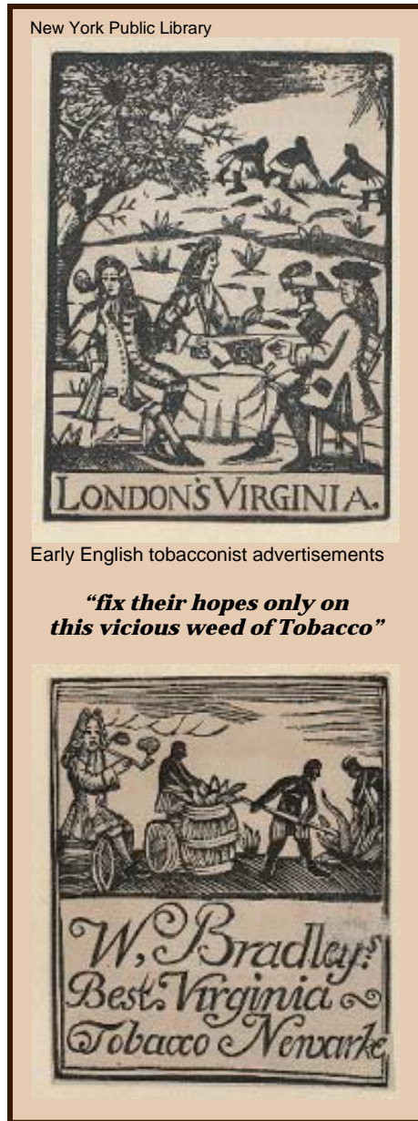
Early English tobacconist advertisements

“fix their hopes only on this vicious weed of Tobacco”