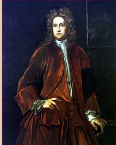
Gov. William Berkeley