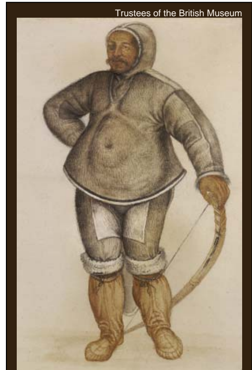
Inuit man, woman, and child brought to England by Martin Frobisher (watercolors probably by John White)

. . . [T]here was, you might say, an "Anglophobia," which he had from when he first arrived, even though his fairly cheerful features and appearance concealed it and gave a false impression with considerable skill. His own actions, however, either betrayed it openly and exposed it (as it seemed to me when I was looking into individual things more closely and mistrusting everything), or else betokened an incipient fatal illness (as I declared often enough, but nobody would listen). These signs